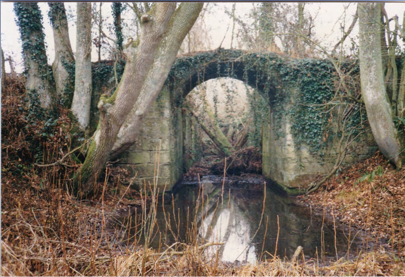
Drungewick Lock and Bridge early 1980s