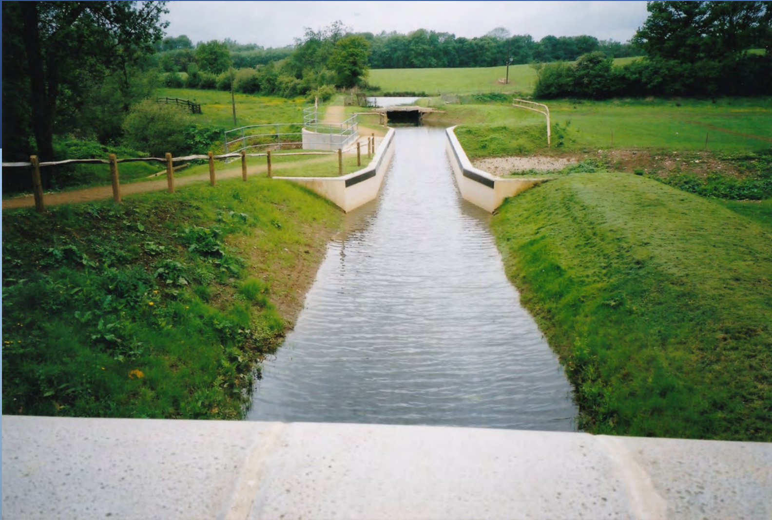
Drungewick Aqueduct 2003. The heavy plant crossing can be seen upstream of the aqueduct.