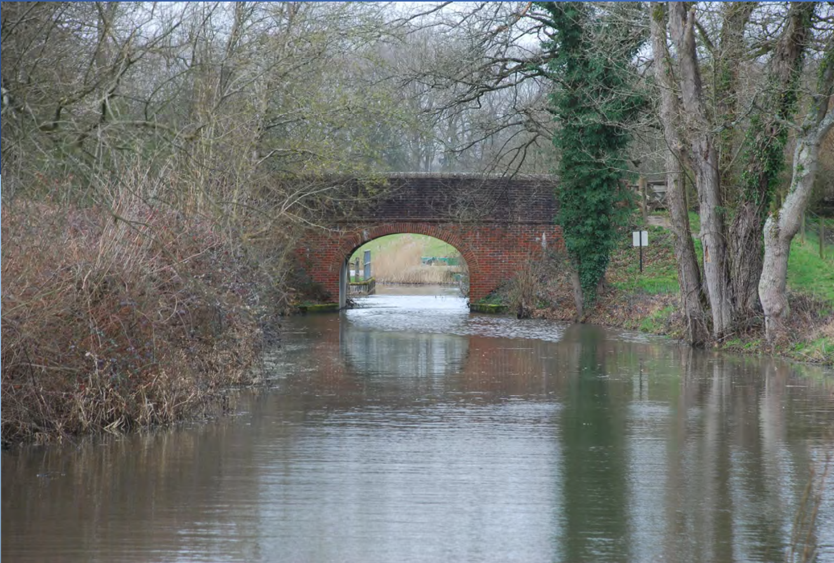
Drungewick Lane Bridge with the aqueduct beyond. 2023.