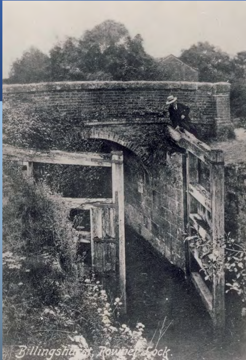
Rowner Lock 1903.