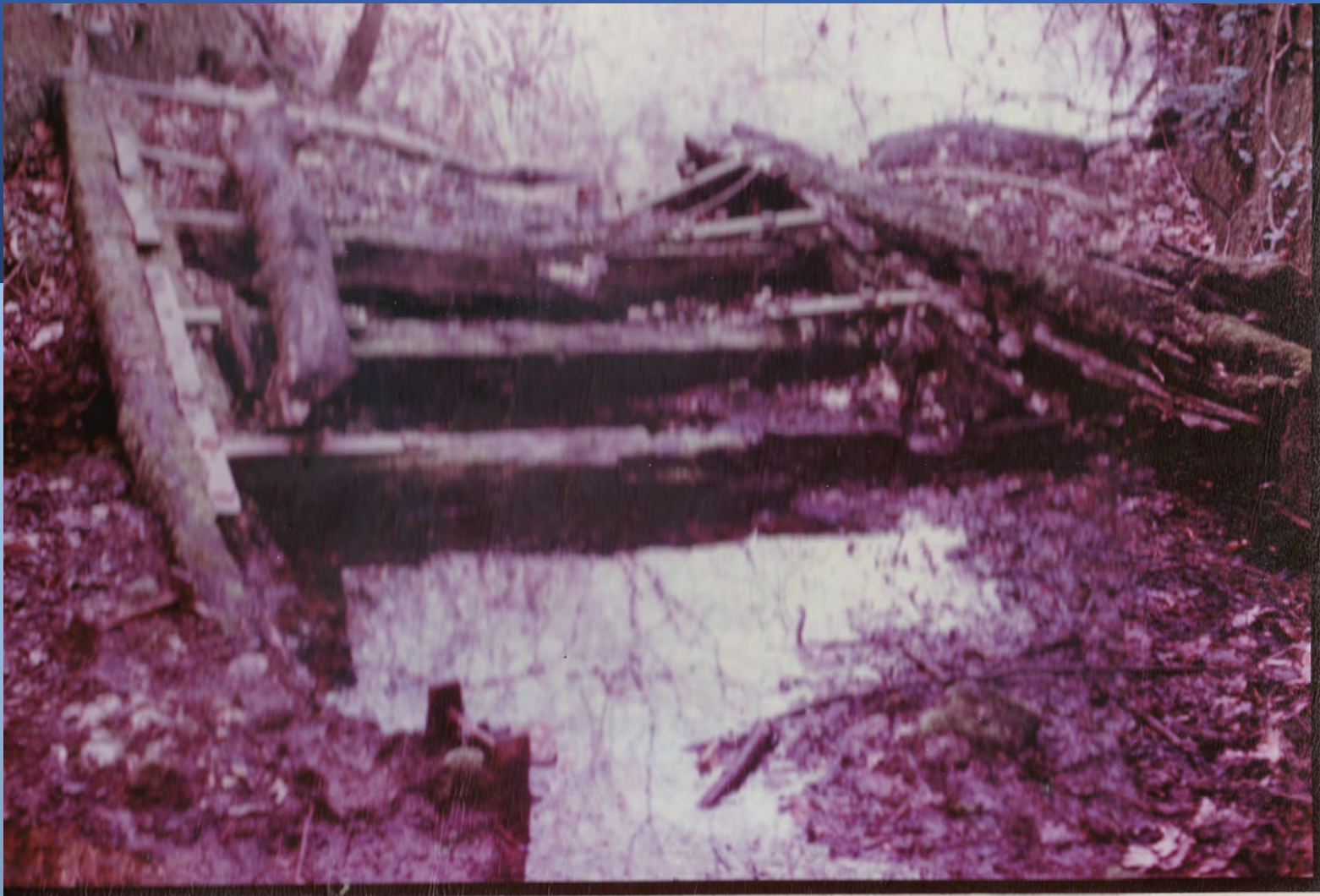
Old lock gate at Brewhurst Lock

Brewhurst Lock. By 1979 the gates had collapsed into the chamber.