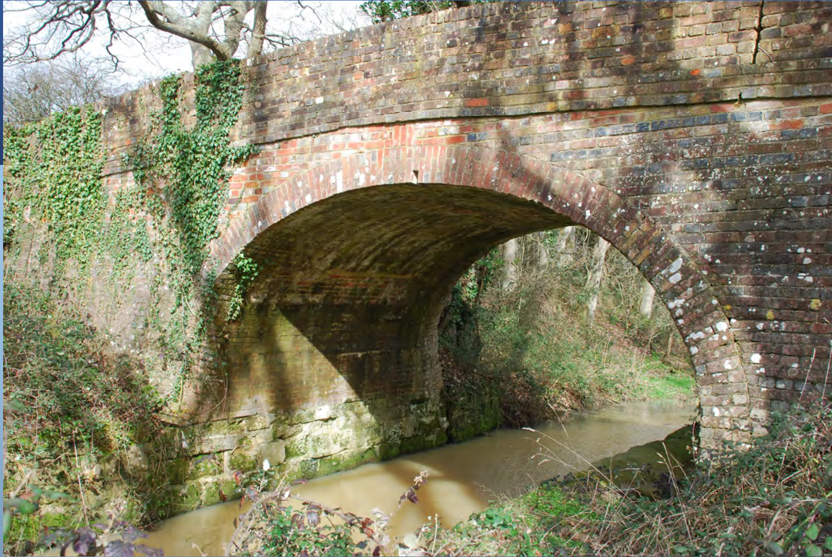
Bignor Bridge 2023.