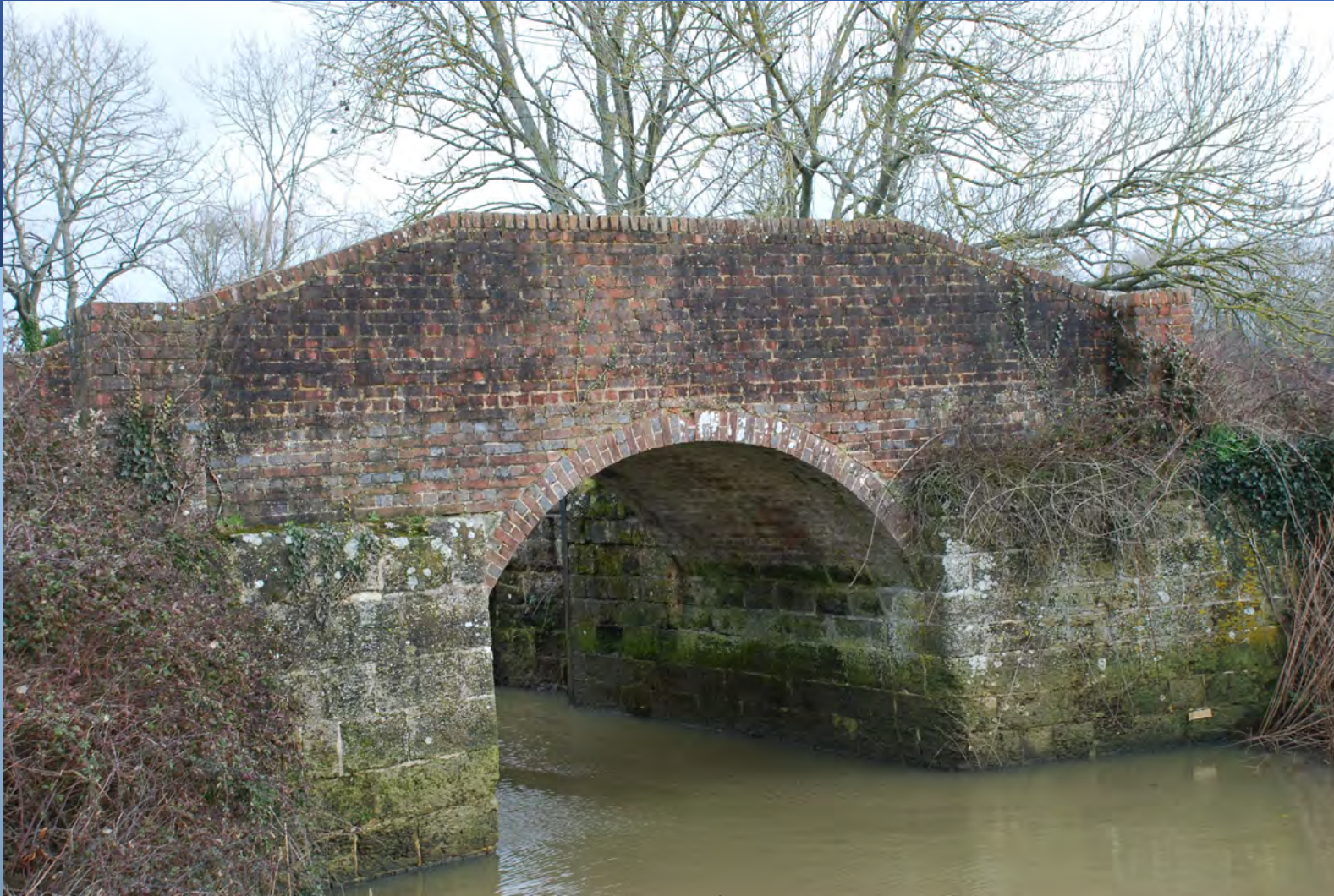
Rowner Bridge 2023.