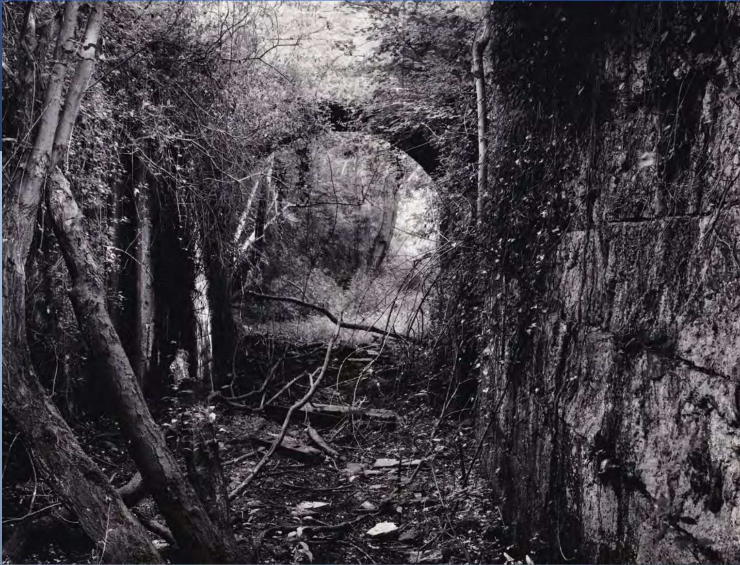
Devil's Hole Lock chamber 1978.