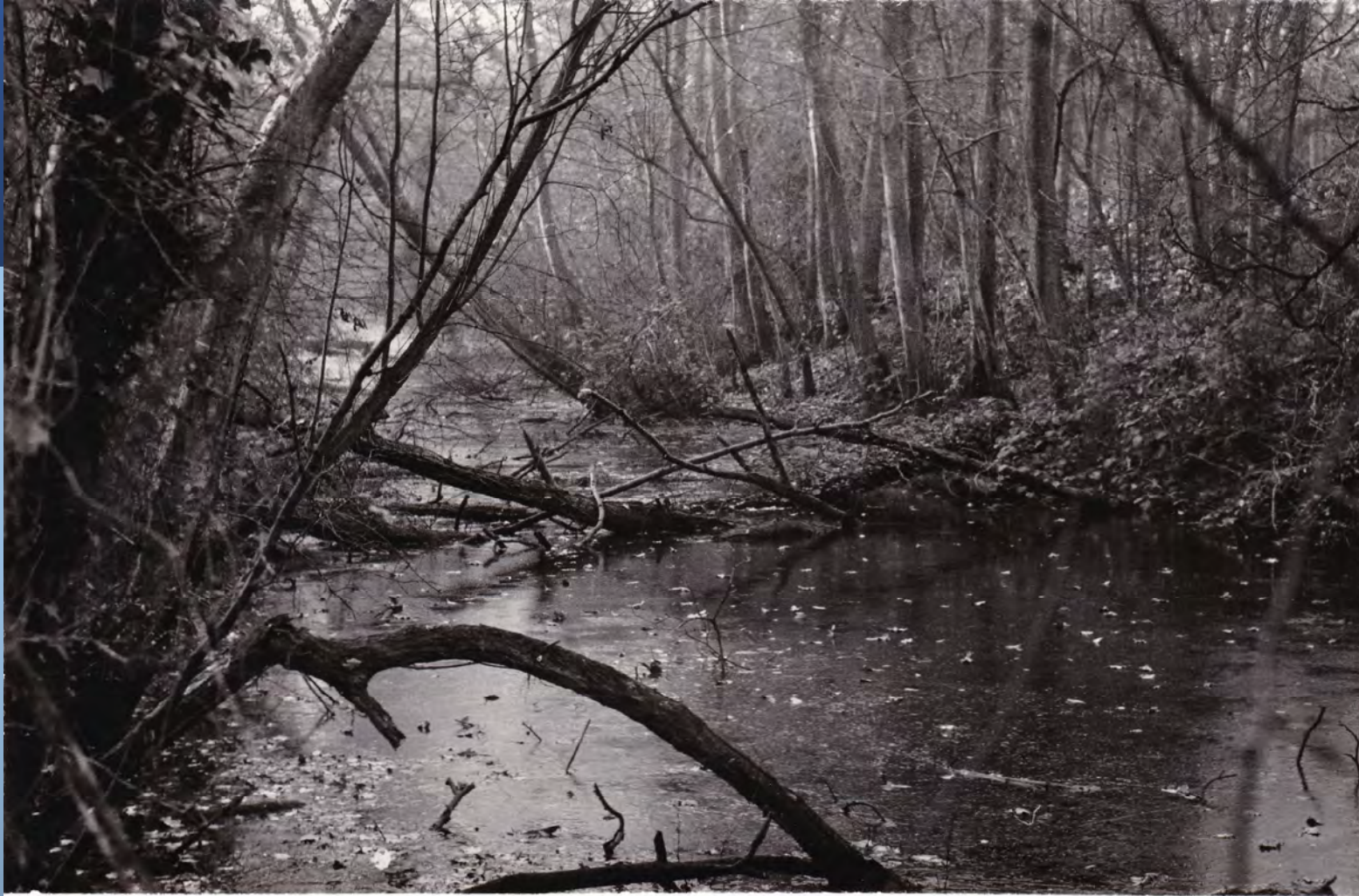
View from Compasses Bridge 1979