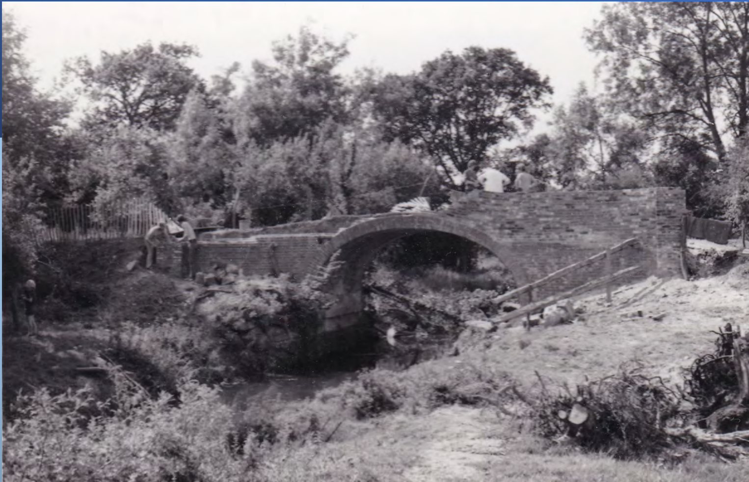
Loves Bridge 1974.

In a very sorry state. Parapets missing on both sides of the bridge