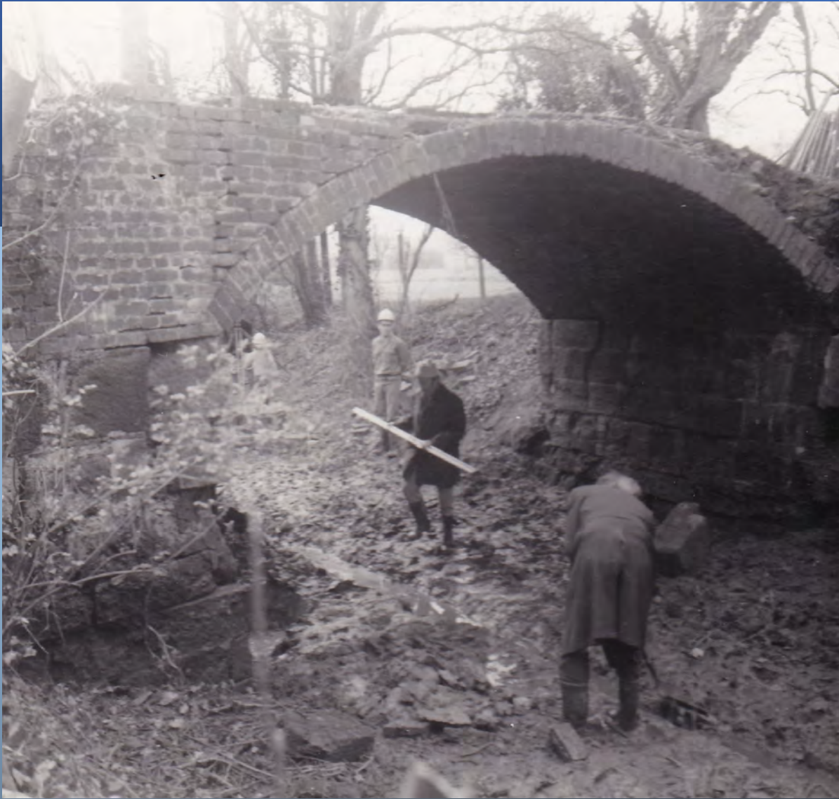
Pallingham Bridge 1974.

I'm not sure if the man standing under the bridge is brave or foolhardy.