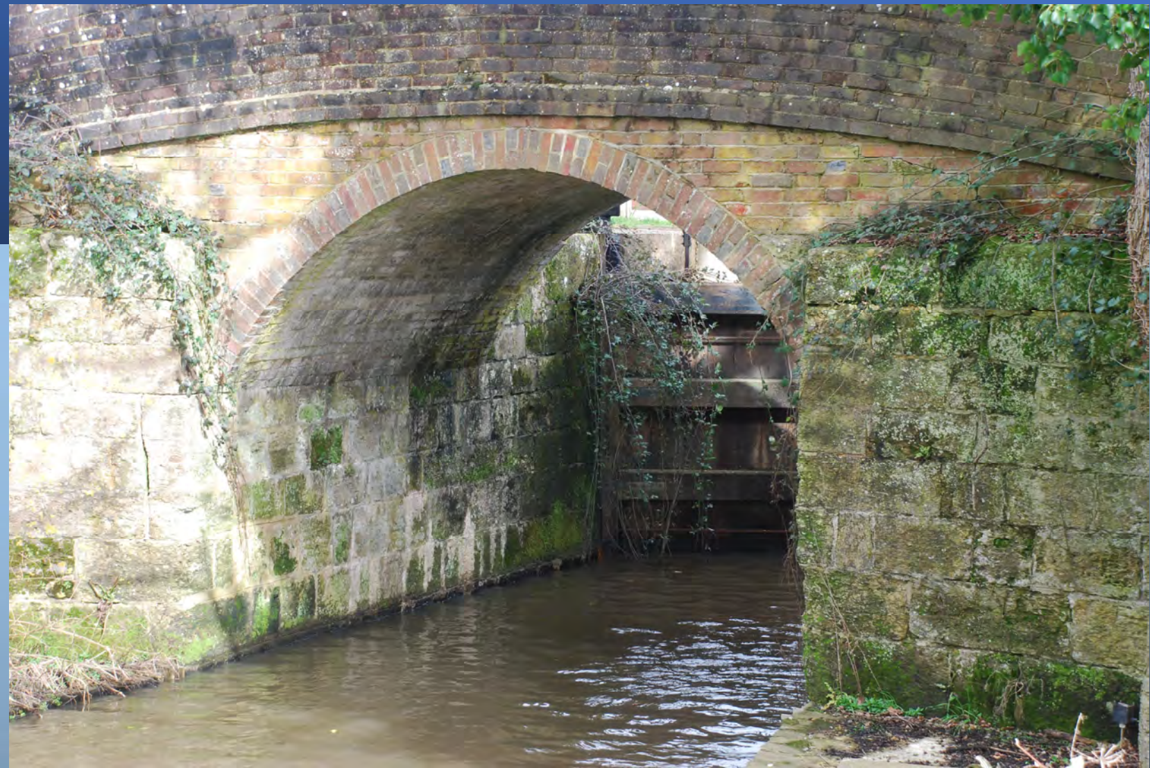
Drungewick Bridge 2023.