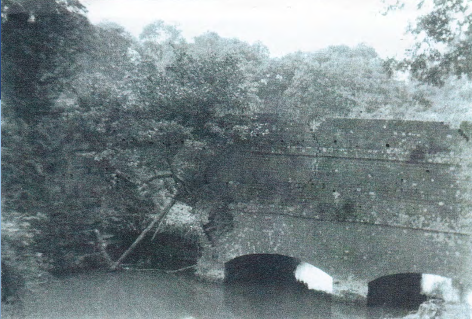
Drungewick Aqueduct over the Lox in 1934. Ruins were believed to have been demolished in 1957.