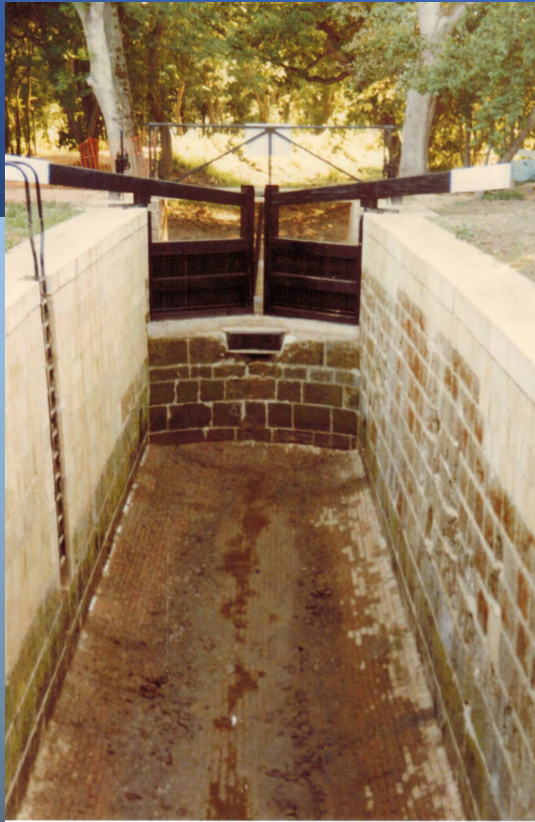
Brewhurst Lock 1994. Looking towards Loxwood. Note the height of the lock walls