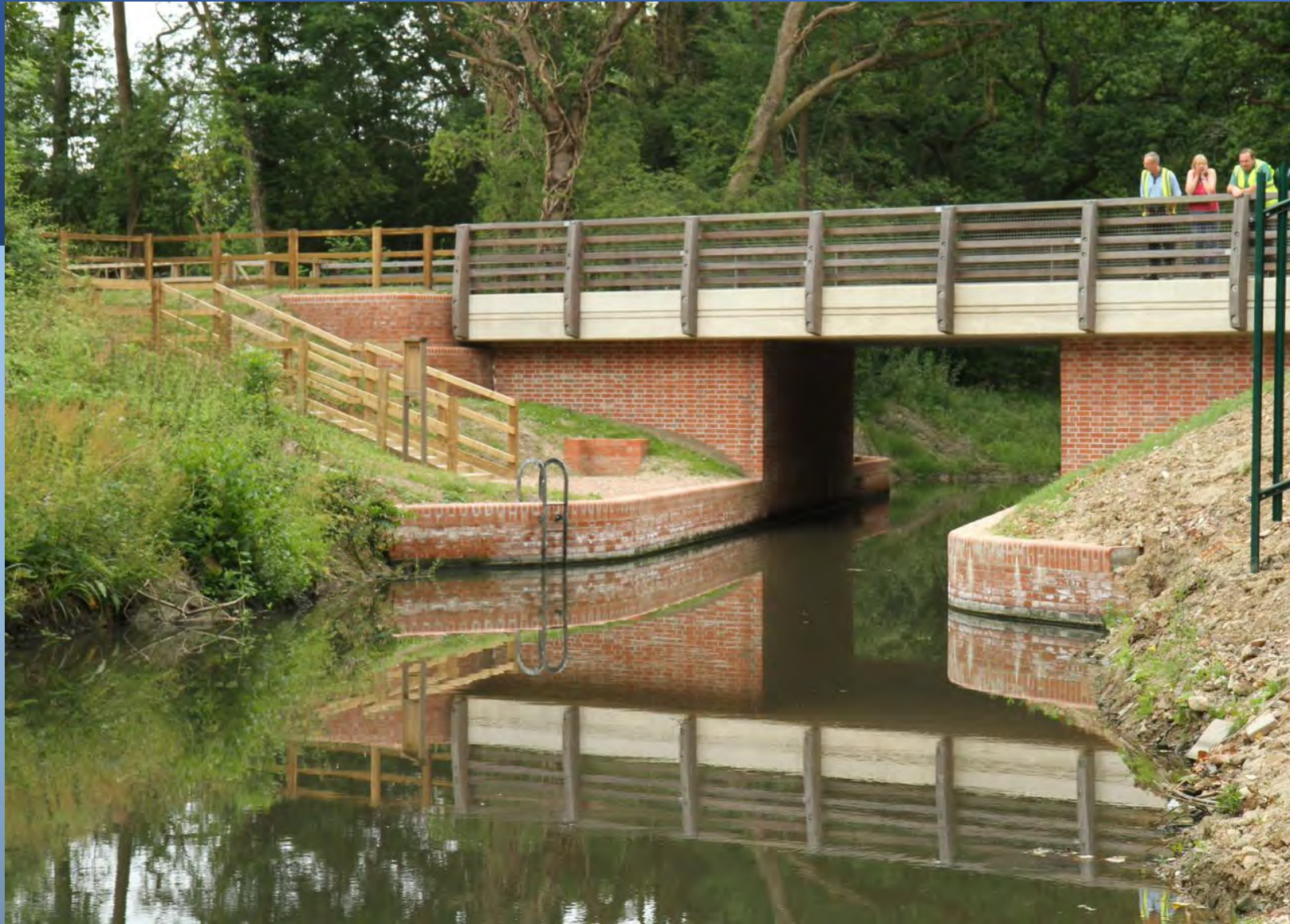
Compasses Bridge 2017, soon after opening.